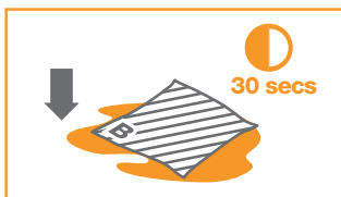
5. Place the active side (A) face down onto the spill. Leave to absorb for 30 secs.