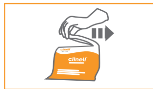
2. Tear the pack open.