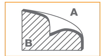
4. A is the active side and should be placed on the spill.