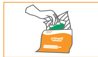
3. Remove the wipes.