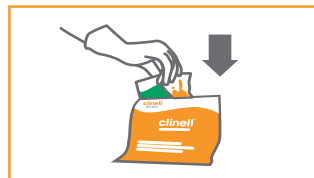
10. Place the soiled wipe and empty sachet back into the pack.