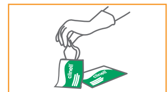
8. Remove a disinfectant wipe from the sachet.