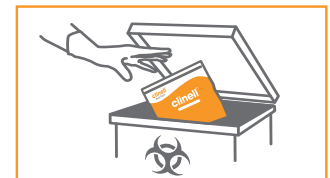
12. Dispose of in the appropriate waste stream.