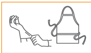
1. Wear appropriate PPE.

Clinell Spill Wipes were created to make the entire process of dealing with body fluid spills easier and safer. They increase compliance in this necessary, yet often neglected, infection control procedure in a cost effective manner.