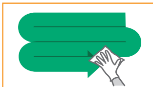
9. Clean the spill area in an 'S' shaped motion, from clean to dirty.