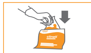
7. Place the soiled wipe back into the pack.