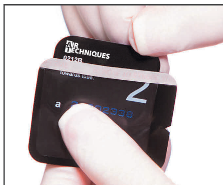
Figure 7a Insert the PSP.

Insert the erased PSP into the Barrier Envelope so the printed side of the PSP is visible through the transparent side of the envelope. Peel off the adhesive strip and seal the envelope. See Figures 7a - 7c below.