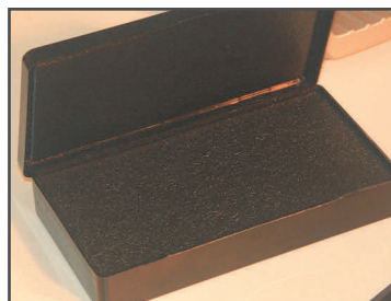
View A Empty Transfer box