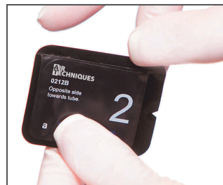
Figure 7c Seal the Barrier Envelope.