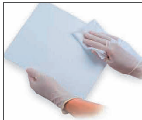
Figure 6. PSP Cleaning