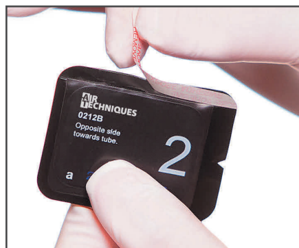
Figure 7b Peel off the adhesive strip.