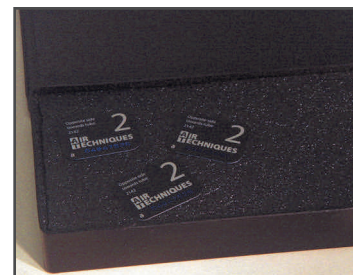
View C PSPs ready for Scanning